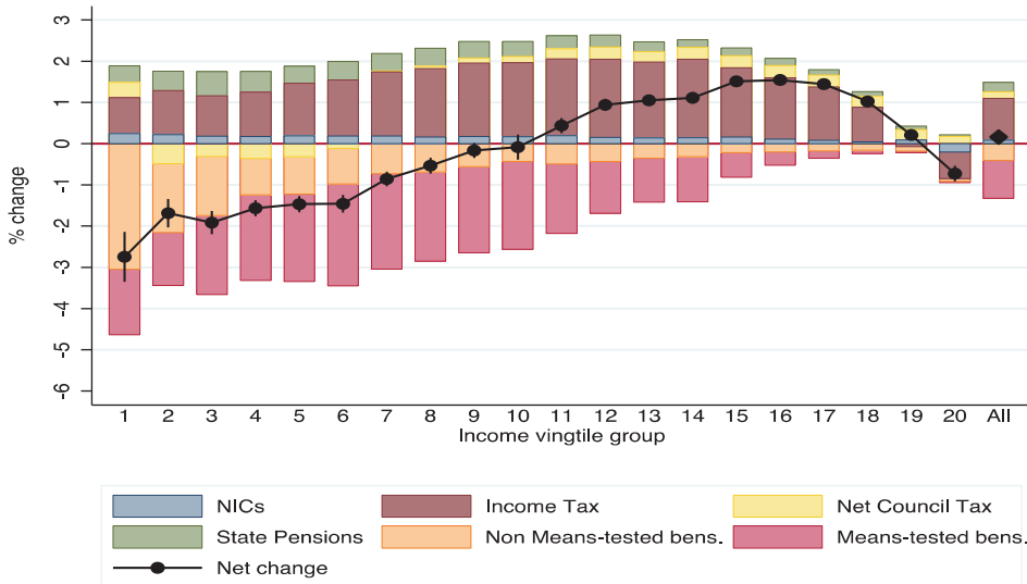
Figure 2: The combined impact of direct tax and cash transfers was mostly regressive, moving incomes from poorer households to those that were better off.

Figures show percentage change in household disposable income by income group due to policy changes, compared with May 2010 system uprated by CPI.