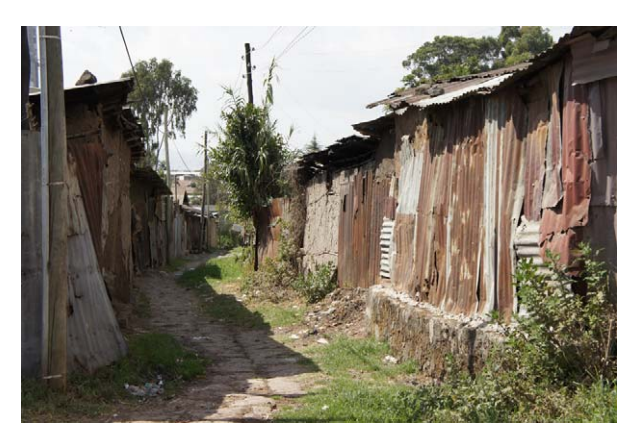
Urban slum in Addis Ababa.

adjustment in the midst of difficulty, thus engendering resilience. By the same token, adults often express the view that boys and girls grow morally and socially and acquire crucial life skills by helping alleviate household hardship (Crivello & Boyden, 2011). In other words, moderate risk exposure is thought to have certain developmental benefits.