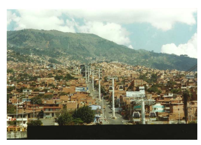
Colombian Research Site

Of the 16 participants in the study, not one has requested their identity be concealed.