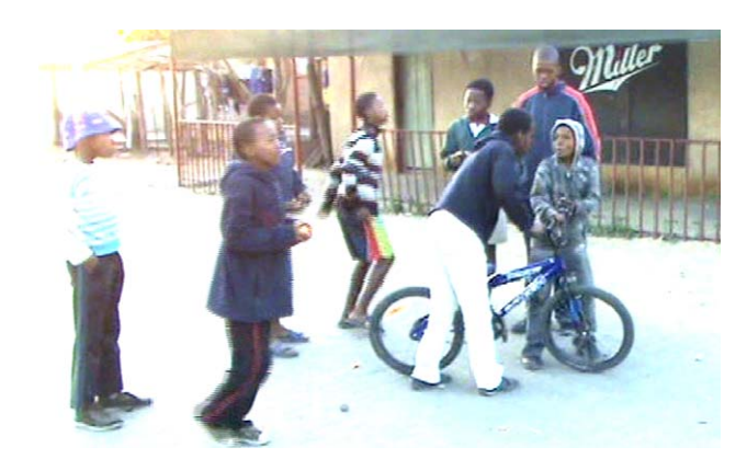
Figure 2. On the street in a South African township community children and youth spend hours riding a bicycle, that belongs to one of them but that becomes a shared possession for the course of the late afternoon's play. They take turns in riding it, teasing one another and cheering.

There are both risks and rewards in the application of these methodologies and many lessons/challenges in the investigation: