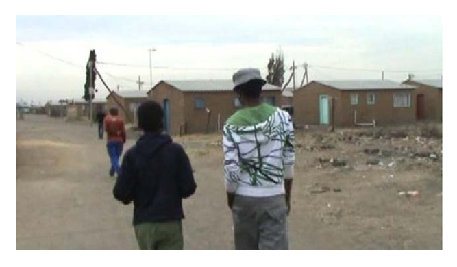
South African Research Site

As a compromise the REB of the institution at which central funding for the research was held, agreed that consent of a parent or legal guardian could be waived in instances where youth 14 years and older had a valid concern with regard to their participation. Such concerns would be noted on the consent form and the consent process would occur in the presence of a third party witness who would also be required to sign the consent document. In practice, these