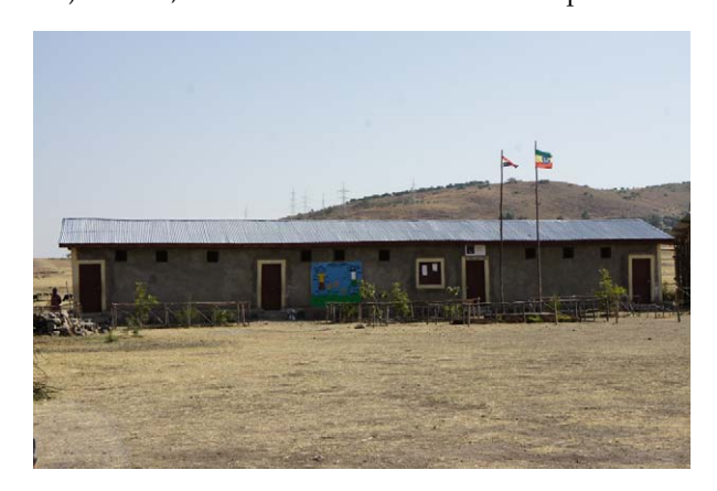
A school in a rural site in Ethiopia.