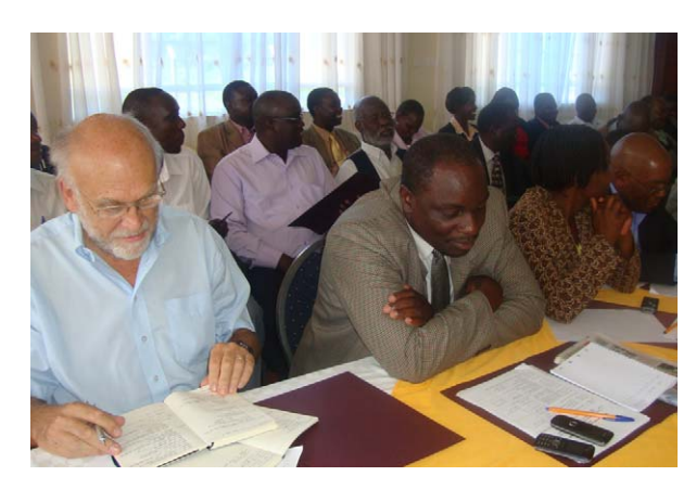
Staff at Masinde Muliro University in a workshop to enhance learning outcomes.

In summary, there is a vast body of knowledge in Kenya in the area of human development which if put into practice can improve the quality of life in the country and can be emulated by other countries. The human resources in the area of human development and psychology are also growing steadily; however, there is a need to diversify the areas that are studied. There is a need to encourage collaboration among researchers and ensure that the information obtained is disseminated to contribute to the body of knowledge and practice and to benefit the end user.